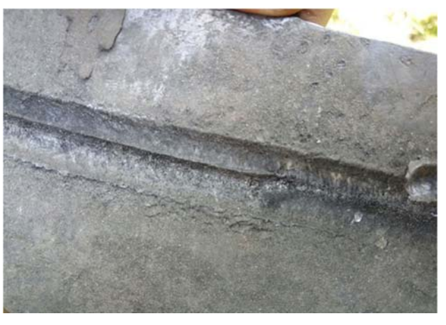
Fig. 7 Formed notch after the detonation

Figure 6 shows prepared detonation scheme. The diameter of the openings in which longer and shorter cords are pulled in is 7 mm. The length of the slow-burning cord, which is used as detonator, is 30 mm and it takes approximately 30 seconds to create impact on explosive. After the test is completed, distance of the formed notch is measured from the end of the plate and it is 120 mm. Formed notch is shown in Figure 7.