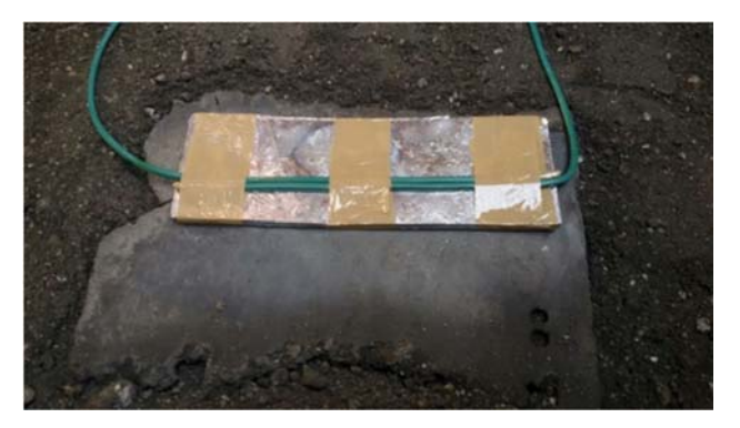
Fig. 5 Lead and steel plate