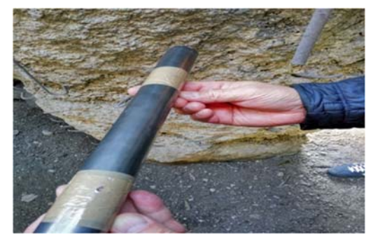
Fig. 3 Explosive Vitezit 20

The test is performed three times and as result the medium value is taken. First testing was with plastic explosive Vitezit 20, shown in Figure 3. A seamless tube, 28 mm in diameter and length of 500 mm, was used.