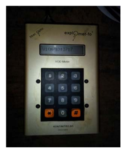
Fig. 9 Electronic clock for measuring of velocity of detonation

As it shown in Fig. 9. velocity of detonation of powder explosive Amonex 1 is 3717 m/s.