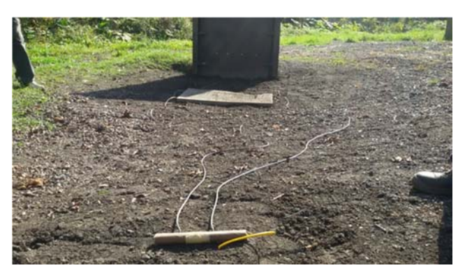
Fig. 8 Powder explosive

According to (1) velocity of detonation is calculated and it is 5000 m/s. Another testing was carried out using powder explosive, Amonex 1. The length of the tube was 200 mm and the distance between cords was 100 mm. The diameter of tube was 30 mm. Fig. 8. shows this testing where right cord represents start and left cord represents the end of explosion.