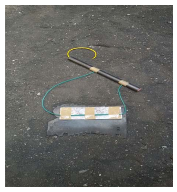
Fig. 6 A prepared detonation scheme

Figure 6 shows prepared detonation scheme. The diameter of the openings in which longer and shorter cords are pulled in is 7 mm. The length of the slow-burning cord, which is used as detonator, is 30 mm and it takes approximately 30 seconds to create impact on explosive. After the test is completed, distance of the formed notch is measured from the end of the plate and it is 120 mm. Formed notch is shown in Figure 7.