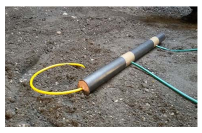
Fig. 4 Explosive with cords