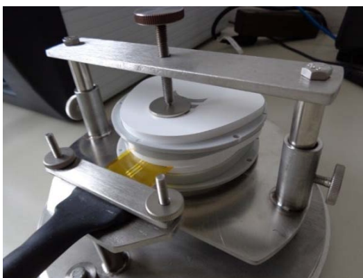
Fig 2 Sensor sandwiched between two halves of a sample during measurement.

During measurement of solids, encapsulated Ni-sensor is sandwiched between two halves of the sample (Figure 2) and constant precise pre-set heating power is released by the sensor, followed by 200 resistance recording in a pre-set measuring time, from which the relation between time and temperature change is established. Based on time dependent temperature increase of the sensor, thermal properties of the tested material are calculated.