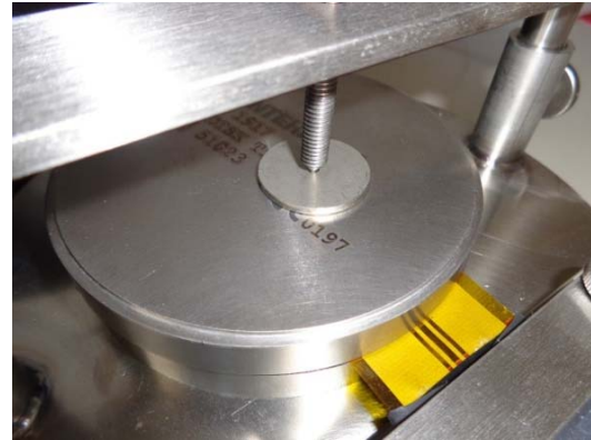
Fig. 4 Testing disk from TiAl6V4 alloy.

TiAl6V4 (Grade 5: 6% Al, 4% V, 0.25% > Fe and 0.2% > O (bal. Titanium)) is the most commonly used titanium alloy in dentistry. It is significantly stronger ( R_m > 895 MPa, R_{p0.2} > 828 MPa) than commercially pure titanium while having the same stiffness. This grade is an excellent combination of strength, corrosion resistance, weldability and machinability, and has good osseointegration properties.