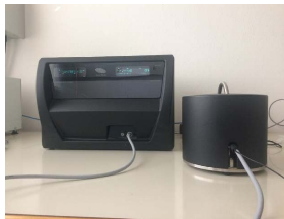
Fig. 3 Measurements in the Laboratory for measurements, Chair of Thermal Engineering, Faculty of Natural Sciences and Engineering, University of Ljubljana.

A few decades ago, yttria (Y 2 O 3 ) stabilized zirconium oxide ceramics (3Y-TZP (3mol.% yttrium tetragonal zirconia polycrystals)), with significantly improved mechanical properties compared to silicate ceramics and glass ceramics was introduced into dental medicine. 3Y-TZP is available in dentistry for the fabrication of dental crowns and fixed partial dentures. Its flexural strength reaches 900 – 1200 MPa and fracture strength about 9 – 10 MPa(m) 1/2 .